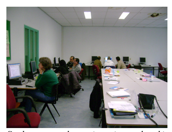
Students started experimenting and making their own digitale.

One of the results is shown in the short film one of the group of students created.